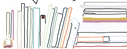
View From the Shelf

Be helpful? Possibly. Be weird definitely!