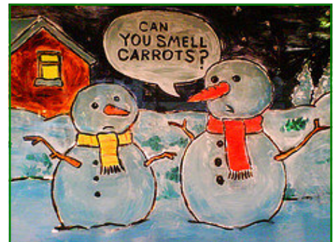
Cartoon from a11sus on Flickr used by permission of a creative commons licence: attribution-Non-Commercial-No Derivative Works 2.0

Comparisons of two sources can even be seen visually such as the dia-